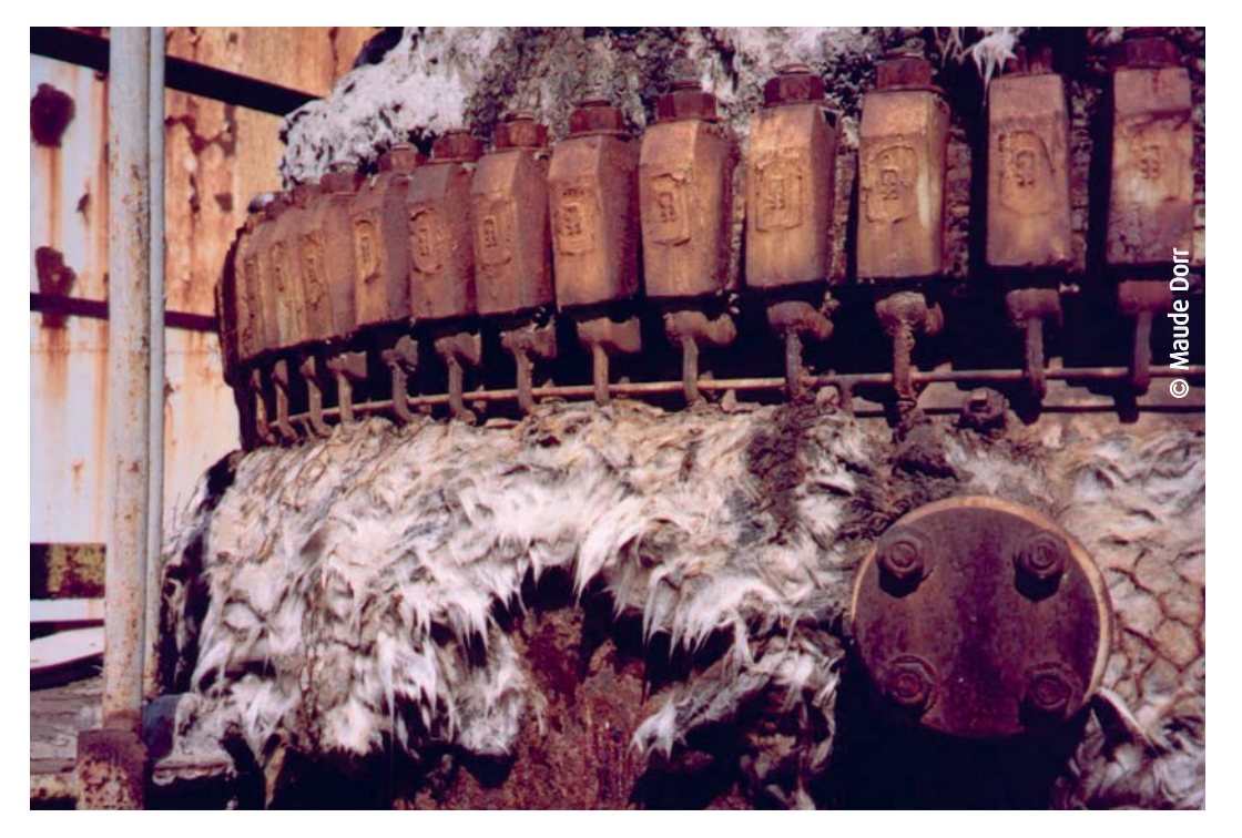
Because of the location of the plant and the direction of the wind on the night of 2/3 December 1984, the gas leak disproportionately affected the